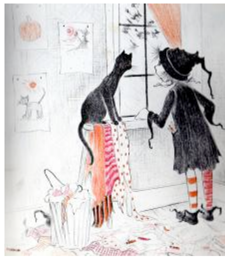
Figures 6 and 7. Images taken from: Combs, Patricia. Dorrie and the Haunted House . (New York, Lothrop, Lee and Shepard Co., 1970).

Seeking shelter, Dorrie heads to the nearby woods where she discovers “a big gray house looming between the trees” (13). Rather than appearing apprehensive Dorrie scurries “up the broken steps to the old porch” where “broken shutters banged in the wind” and “vines and branches skreeked” against the clapboards (14). Without hesitation, Dorrie enters the house and eagerly tours its grandiose rooms. She soon discovers she is not alone, for the house is also sheltering two criminals, whose presence prompts Dorrie to scramble from one space in the house to another, trying to escape the men’s voices which start “yelling louder and louder” and sound “madder and madder” (27). After falling into a bale of flour, Dorrie becomes aware that the Big Witch and her counterparts have come to find her: upon seeing Dorrie’s ghostly-white appearance her potential saviours turn and flee. Terrified at the prospect of being alone in the house with two malevolent criminals, Dorrie flees for home. The most disturbing threats she encounters in the “haunted house” are therefore not ghost-related. Rather, the verbal aggression – and potential physical hostility - of the two male criminals, as well as the abandonment by her network of family and friends are the warranted concerns in this tale.