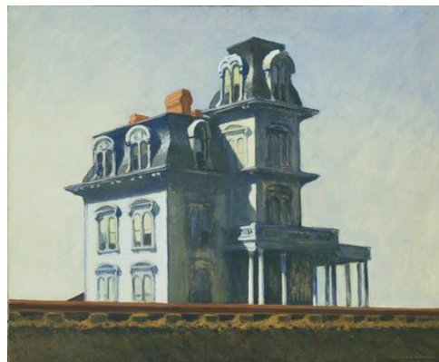
Figure 3. House by the Railroad , 1925, by Edward Hopper.

Likewise, Eve Bunting's 1990 picture book In the Haunted House , aesthetically demonstrates the same prototype. The architectural details in this tale, drawn by Susan Meddaugh, appear to use the same Hopper painting for inspiration; the story's haunted house features white-clapboard siding, arched windows, a turret, and a bell-cast mansard roof (see figure 5). Readers are told "this is the house where the scary ones hide" and we are encouraged to "open the door and step softly inside" (1). Provoking readers to enter an evidently threatening dwelling is a typical plot device in such books and upon doing so we are provided with a tour of the home's various interior spaces. Inside this decidedly elaborate space, with its "cracked chandeliers" and "dark, paneled walls," (5) we encounter an array of ghosts and witches. The book concludes with an image of people lined up outside the home near a sign that states "Halloween House," thus revealing the house is really a carnival fun-house. Again we find the juxtaposition of presenting a haunted house in an initially foreboding and subsequently cheerful manner. The architectural structures that serve as the stage settings within these books denote a particular archetype and the potential reasons for this suggests much about why adults perpetuate haunted house-themed stories for children.