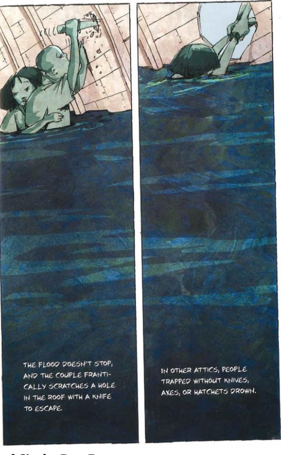
Figure 2: Pages from Drowned City by Don Brown

It is this kind of account, which is both heavily researched (as documented by the extensive bibliography in the back of the book) and also emotionally evocative, that made this graphic nonfiction text an ideal resource for a CAL course.