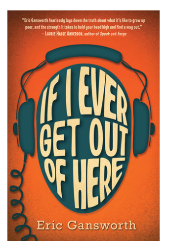
Figure 1: If I Ever get Out of Here by Eric Gansworth

Their strongest tie is music by The Beatles, which offers the lives of these two seemingly contrastive characters a shared soundtrack and serves as blueprint for the reader to follow throughout. Gansworth